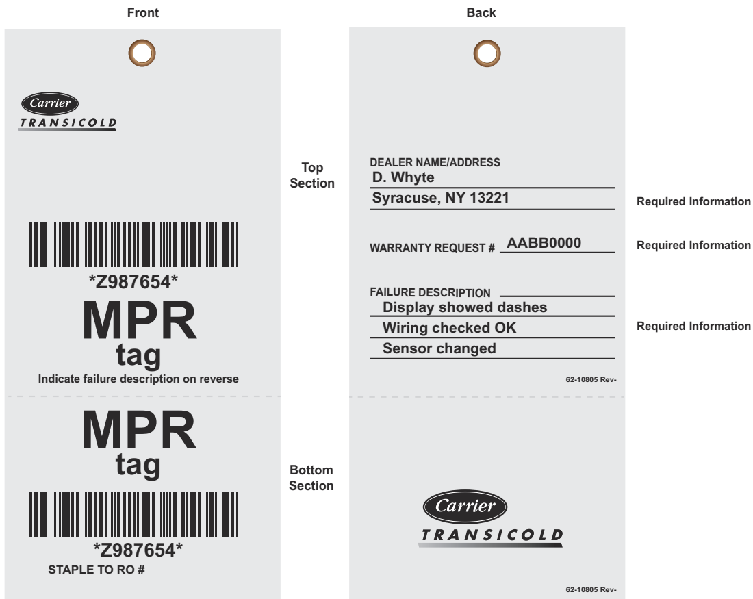
Figure 6.1 MPR Return Material Tag