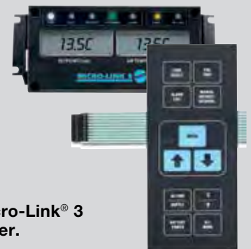
The Micro-Link® 3 controller.