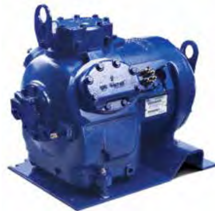
The 06D compressor. Evolutionary technology. Simple operation. Complete satisfaction.